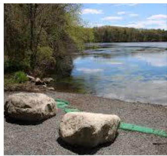
Edwards Road Carry-Boat Launch

We hope you will join us at one of those spots. Let's help make a difference!