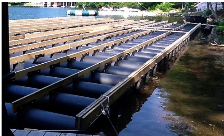
Encapsulated polystyrene floats that are environmentally safe

Encapsulated polystyrene is what you want your floats to be made of as it is surrounded by a polyethylene shell. The shell is a material, usually black, that is harmless to the environment, recyclable and prevents the polystyrene from breaking apart.