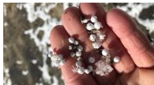
Images of unencapsulated polystyrene, from broken dock floats, in various states of decay.

Unencapsulated polystyrene floats are being increasingly banned on lakes and rivers in a majority of states. While not yet banned on lakes in Massachusetts, many towns are considering it and Foxboro is one of them.